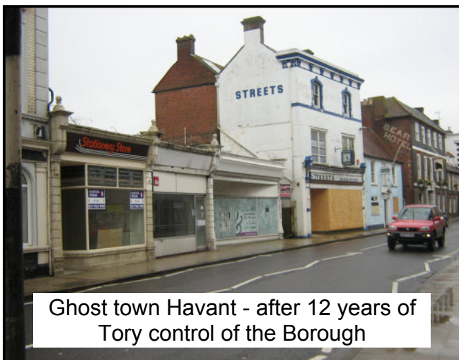
Ghost town Havant - after 12 years of Tory control of the Borough