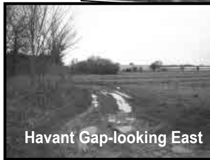
Havant Gap-looking East

Against global warming getting this plan right is vital."