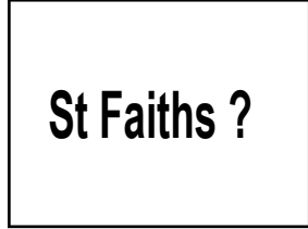
St Faiths ?

St Faiths is the only ward in the area without a Community Centre.